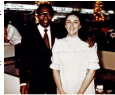
Ann Dunham with Barack Obama Sr. during his return visit to Hawaii in about 1971. The couple divorced in 1964.

Today's Comme If Jews neither - By Jos Beware bipartis - By Ila The Big - By Ro John Ke Barack - By Bu Bipartis Overrat - By Da Has hist by? - By Pa